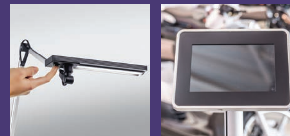
LED task lighting