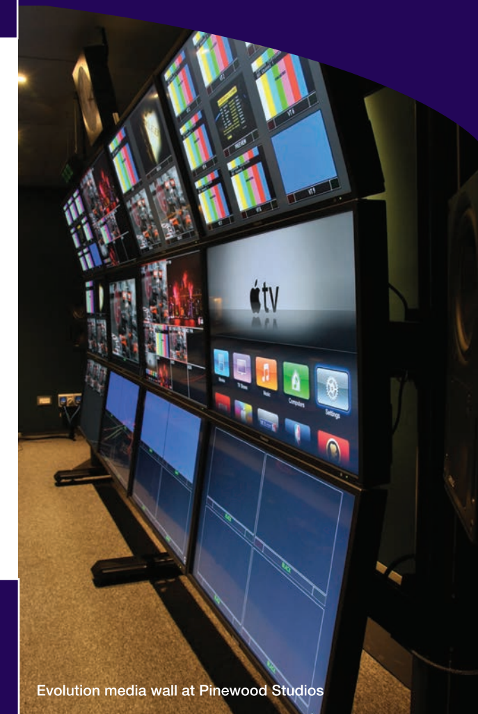
Evolution media wall at Pinewood Studios

Above: just some of the configurations available as standard. For more information, please visit our website www.mw-video.com