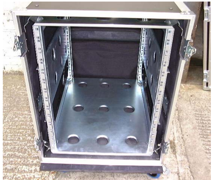
Picture shows Pro-Rack with side brace supports